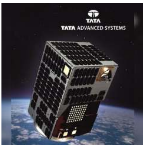
India's first private-sector-built Earth observation satellite

The TSAT-1A weighs less than 50 kg and is in low-earth orbit and it is capable of capture images of areas smaller than 1x1 meter. TSAT-1A also has multispectral and