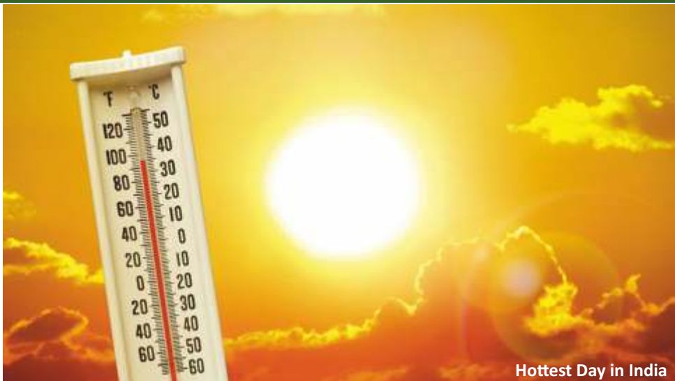
Hottest Day in India

29 May 2024, Delhi: India faced hottest day ever in its weather history. Most of the states of northern part India suffered including India's national capital Delhi attacked by relentless heatwaves with temperature jumping to 52.3°C in the suburbs of Mungeshpur.