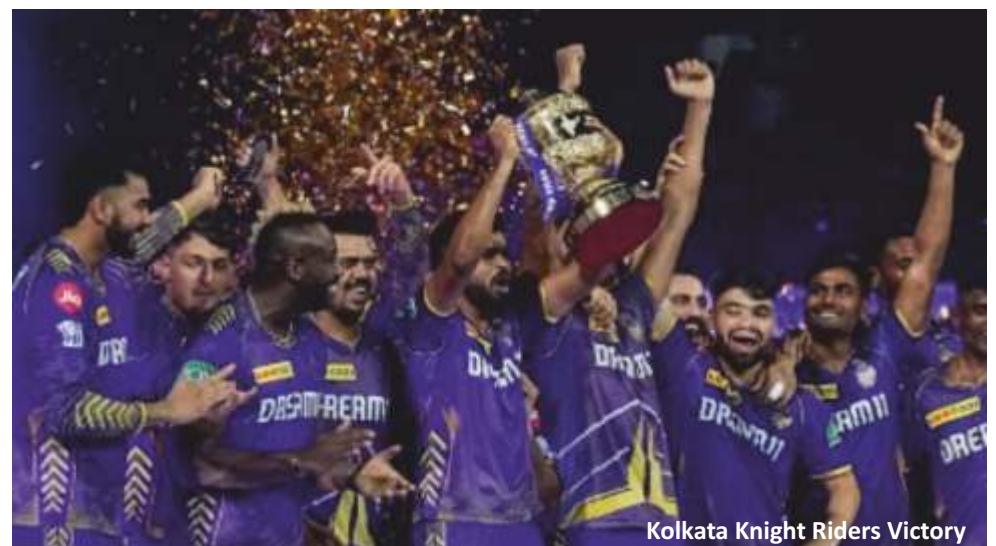
Kolkata Knight Riders Victory

26 May 2024, Chennai: The Kolkata Knight Riders (KKR) won the 17th edition of the Indian Premier League (IPL), also known as the TATA IPL 2024. The season ran from March 22 to May 26, 2024.